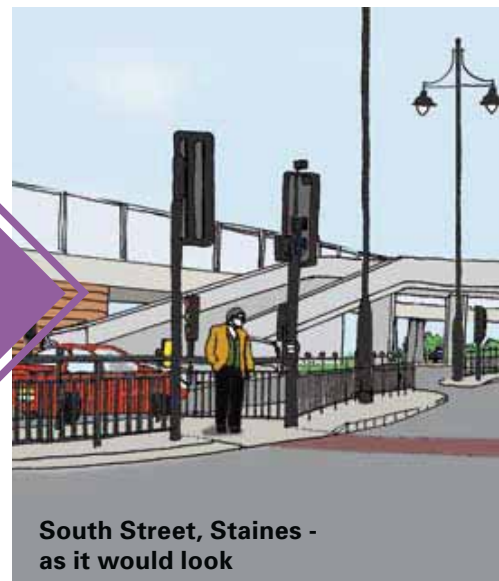
South Street, Staines - as it would look