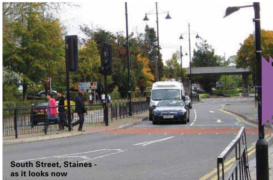
South Street, Staines - as it looks now