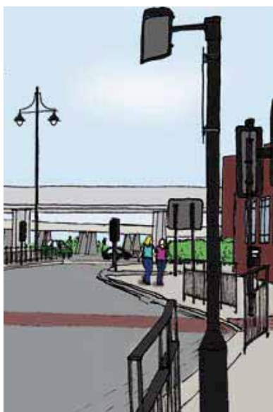
Above map and illustration are courtesy of Heathrow Airtrack