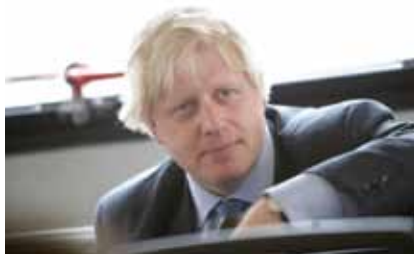
Boris Johnson Mayor of London

That's why from 3 January 2012 the emissions standards will be raised and more vehicles will be affected. In the year when the world heads to London for the Olympic and Paralympic Games, we will demand the highest standards that a great city like ours is entitled to expect.