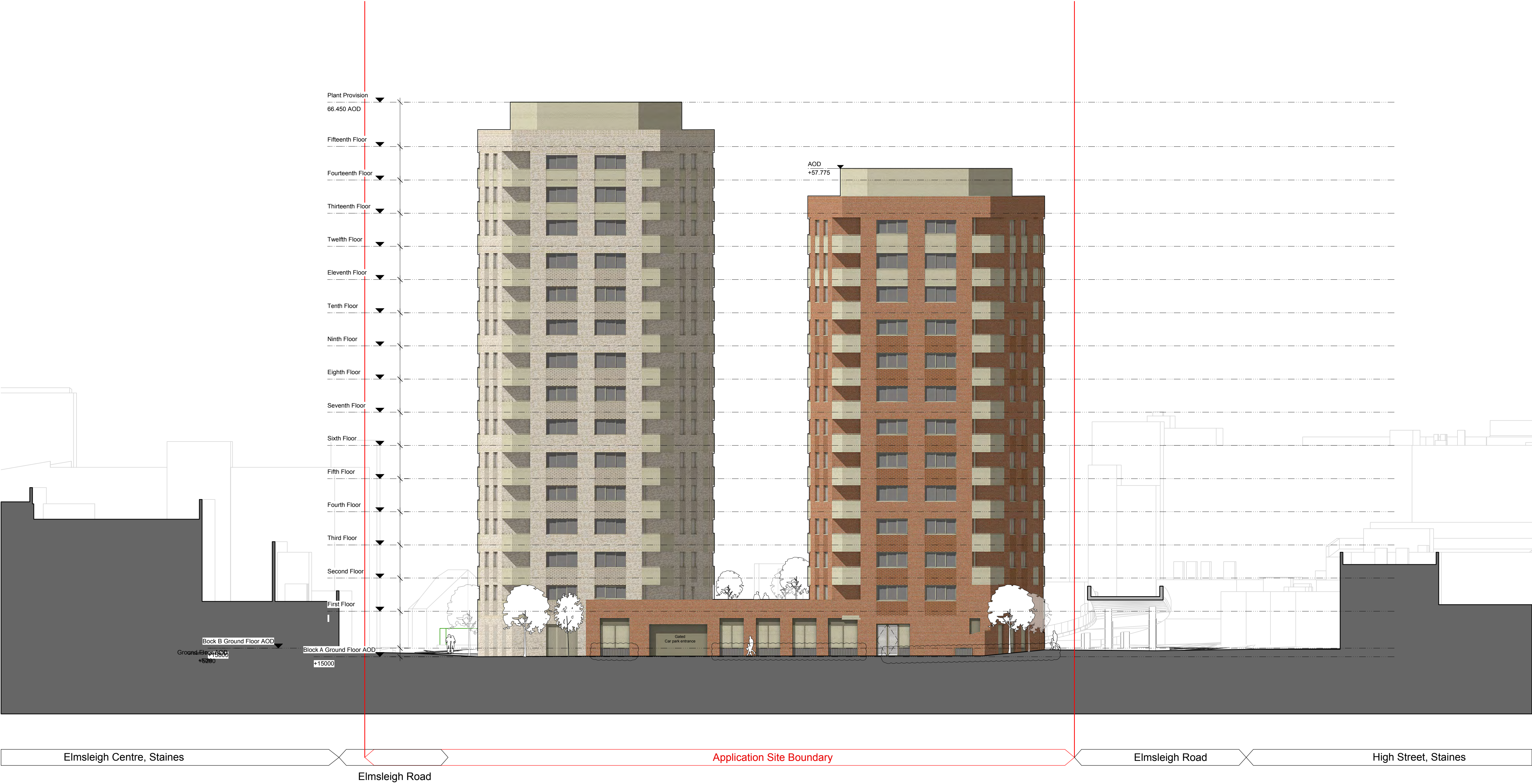
1 East Elevation Scale: 1:200