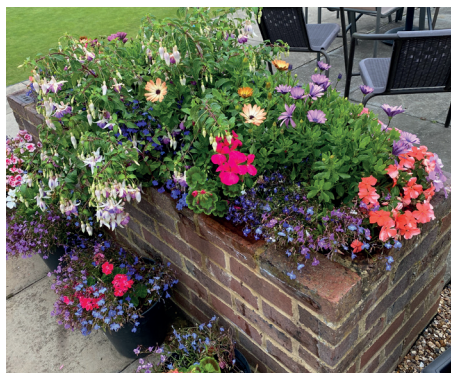
Best Community Garden and Best New Entrant - 2024