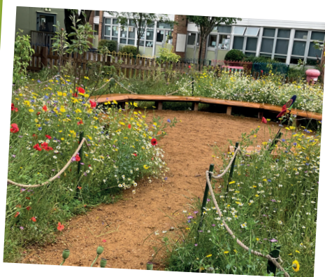
Best School Garden - 2024