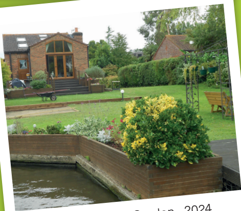
Best Riverside Garden - 2024