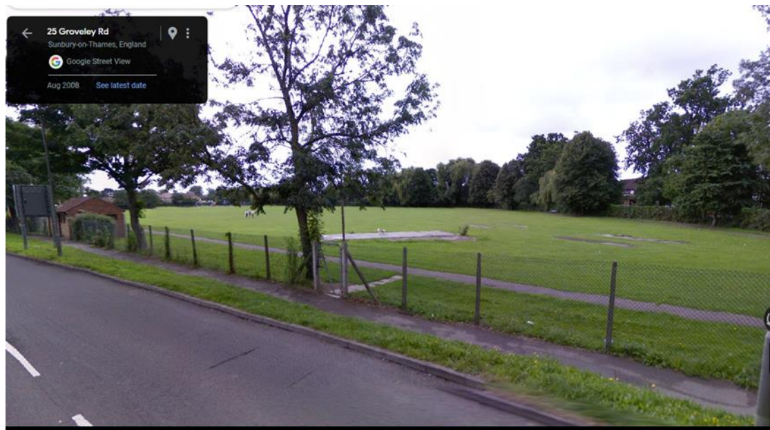
Site of former cricket pavilion