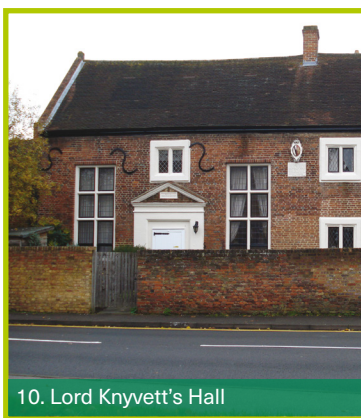
10. Lord Knyvett's Hall