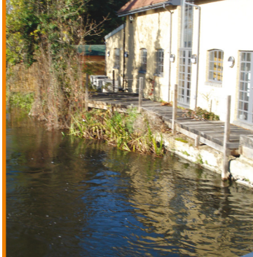
4. Old Mill