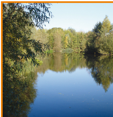
9. Hithermoor Lake

If you are interested in finding out about history in Spelthorne visit www.spelthornemuseum.org.uk